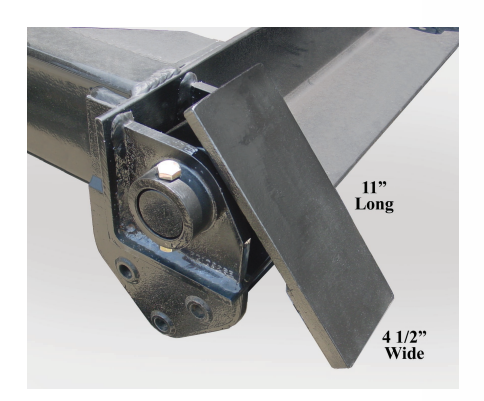
The hinges are cast from extra heave duty 4140 grade steel to ensure durability. Adding to the ease of installation and durability, these hinges are welded to the body's box-type long sills.

This hoist is easily installed to the trucks chassis using extra heavy duty 4140 grade cast mounting brackets. With 18 grade 8 bolts and minimal welding, installation is quick and easy.